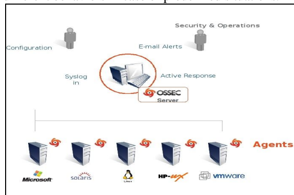
Figure 4. Basic architecture of Ossec.